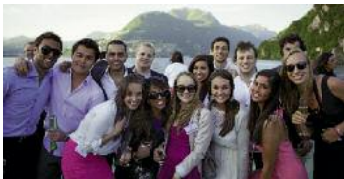
Lugano, Switzerland, Spring 2012: Seniors.