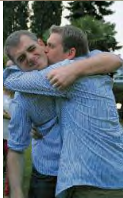
Photos on this page taken at the Welcome Reception and the "Taste of Switzerland" dinner.