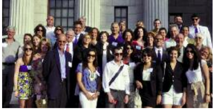
Boston, Massachusetts, Spring 2011: Franklin alumni, parents and friends in front of the Museum of Fine Arts, Boston.