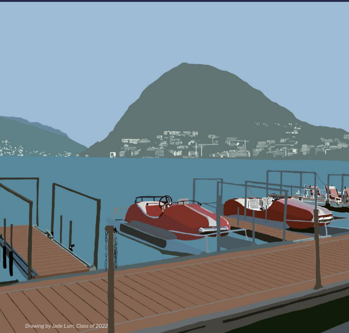
Drawing by Jade Lum, Class of 2022